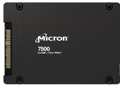
Micron 7500 NVMe SSD (U.3/U.2), 15mm

The 7500 SSD is a versatile solution that delivers the performance required by complex and critical business workloads.