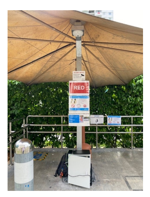
Figure 1: Outdoor Break Area