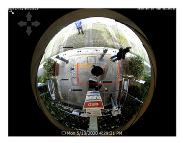
Figure 3: Physical Distance Monitoring (Loitering in restricted zone, voice message states: "Please move to the numbered box.")