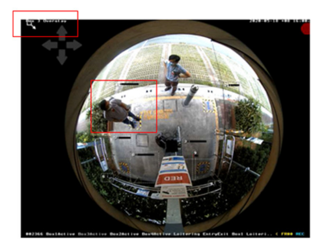
Figure 4: Overstay Monitoring (Exceeding time limit in box 3; voice message states: "Box 03 time limit exceeded, please leave.")

In addition to real-time prevention and compliance support, advanced analytics data is used to determine high traffic flow/alert areas, times and individuals, which can be used to develop better policies, training and systems.